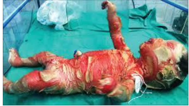
Fig. 1: Harlequin Baby