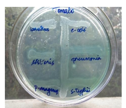
Antibiotic inhibition by Tomato